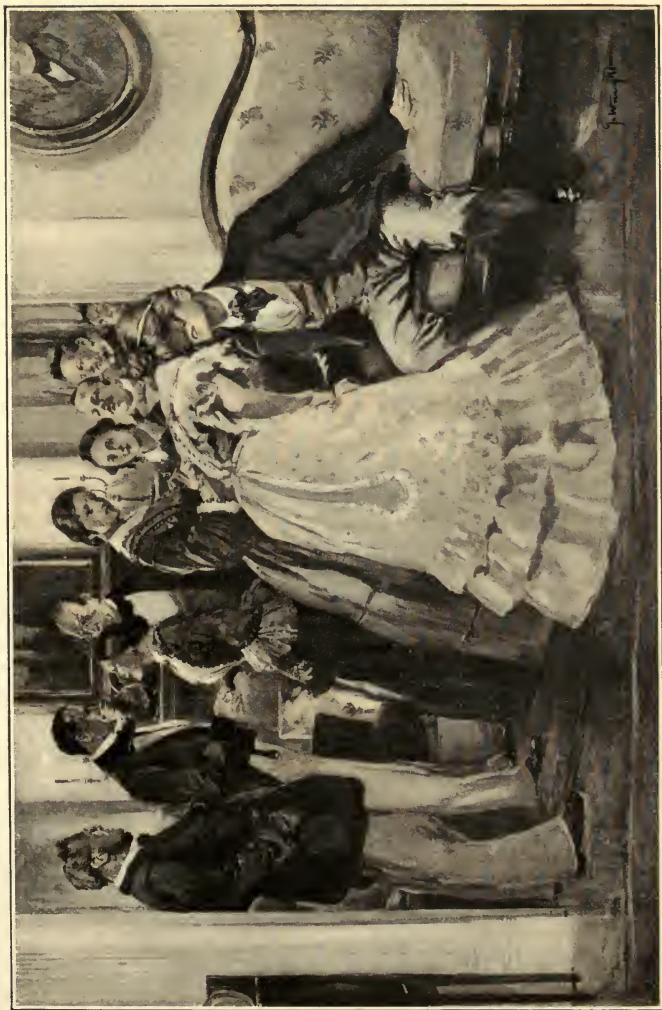
Bart's last whisper to Lucy was in explanation of the little wife's manner.